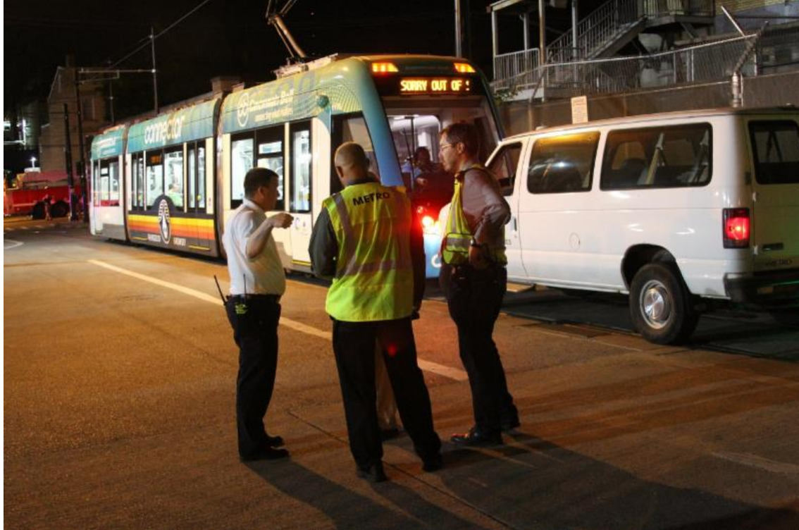
Bike and Ride the Cincinnati Bell Connector

On Tuesday, the Southwest Ohio Regional Transit Authority (SORTA), Transdev, the City of Cincinnati and local authorities conducted the first of a series of full-scale emergency exercises at the Cincinnati Bell Connector Maintenance and Operations Facility in Over-the-Rhine. These tests are to ensure that emergency personnel are ready to assist in the event of an actual emergency.